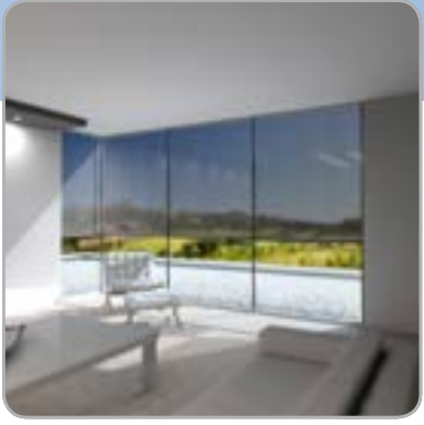
PATENTED TECHNOLOGY & PATENT PENDING